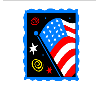
The children are our future.

Divide the class into four political parties, with each party choosing its own name and mascot. Each party holds a "primary" to elect a candi-