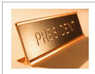
What would you do if you were President?

At several points during the show the "candidates" present their ideas and campaign speeches. Have your students write their own campaign speeches. What issues would they want to discuss? What would people need to know about them?