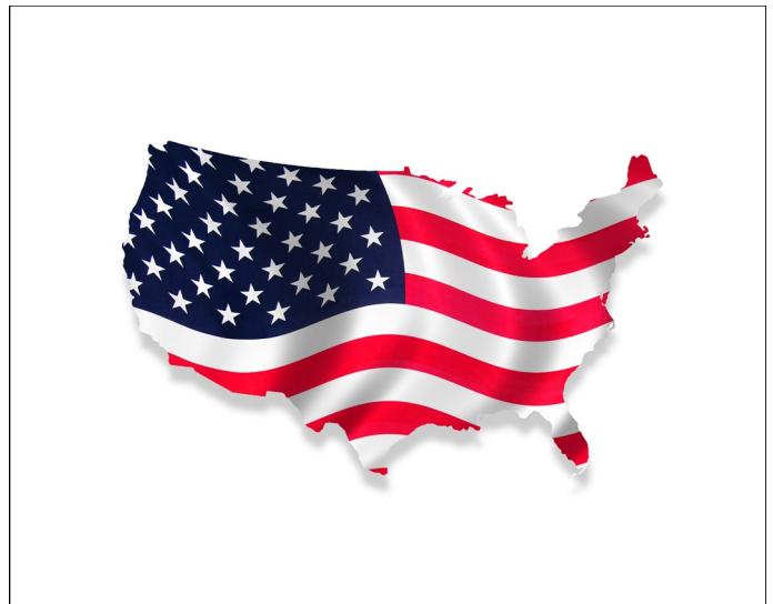
Kids across the country weigh in on the issues facing our country!

Child's Play Touring Theatre has been working with young writers across the country to involve them in the 2024 election. Many children submitted stories, poems, songs, campaign speeches and essays. The show that you will see reflects the very best of the material we have collected. The performance runs ap-