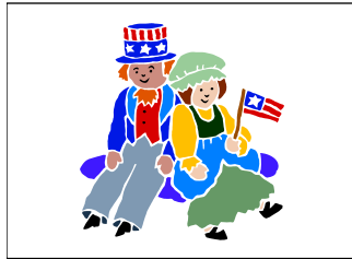
Students prepare for the upcoming election.

As you prepare your students to see Kids For President , begin by using the description on the previous page to tell the children about the show and the company. Then discuss with them what kind of topics they think will be presented in the performance.